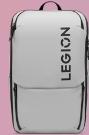
Lenovo Legion 17" Gaming Backpack GB800 (Light Gray) GX41U39300